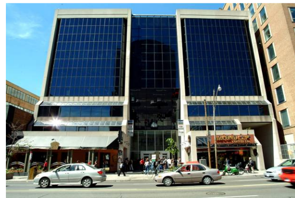
KGIC Toronto Campus

Toronto is home to the world's tallest free standing structure, the CN Tower, and the world's longest street, Yonge Street (1,896km). Also, Toronto is as far south as the French Riviera and has a larger population than all of the Maritime Provinces combined.